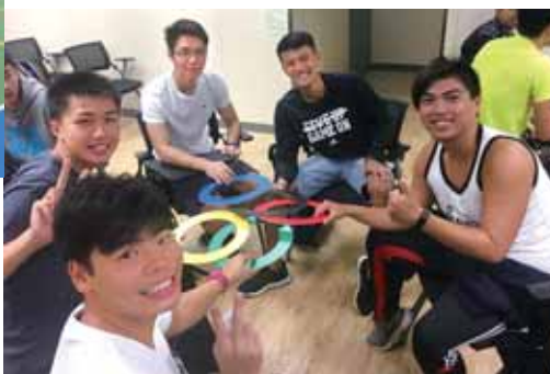
Students grouped to participate interactive games. 學生正參與分組互動遊戲。