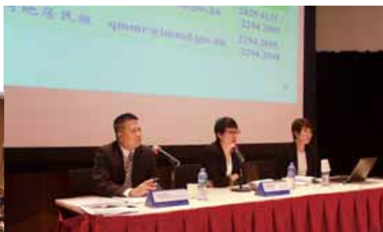
Briefing Session on Visa Requirements for Overseas Participants of International Sports Events in Hong Kong 外地人士參與在港舉行國際體育活動的簽證安排簡介會

其後本會與平機會亦於2018年3月16及23日舉辦了兩場「體育機構防止及處理性騷擾工作坊」，讓參加者進一步掌握實際處理性騷擾投訴個案的技巧。