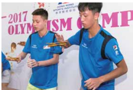
Competing in mock Olympic Games. 體驗奧運競技之旅。

今年的體驗營的48名參加者分別來自7個精英體育項目及15間曾參與「奧林匹克主義教育計劃」和「奧夢成真計劃」的學校。