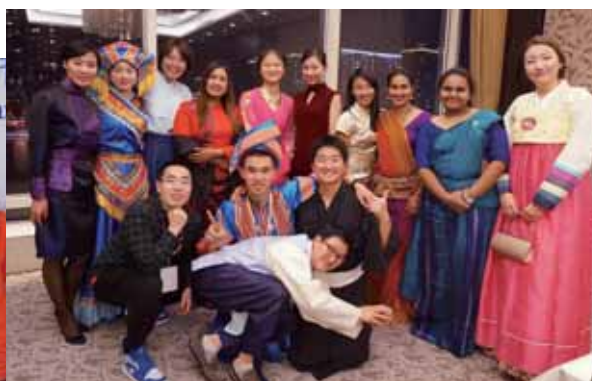
Farewell to the Camp with traditional costumes and performance. 青年營以民族晚會結束。