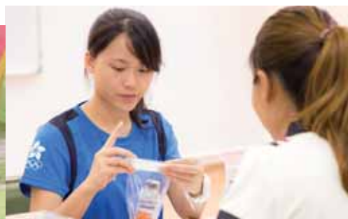
HKADC conducted an anti-doping talk and mock doping tests. 香港運動禁藥委員會安排了運動禁藥管制教育講座及模擬運動禁藥檢測。