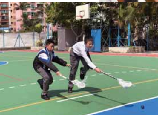
Students experienced special sports event. 學生正體驗專項運動試玩。