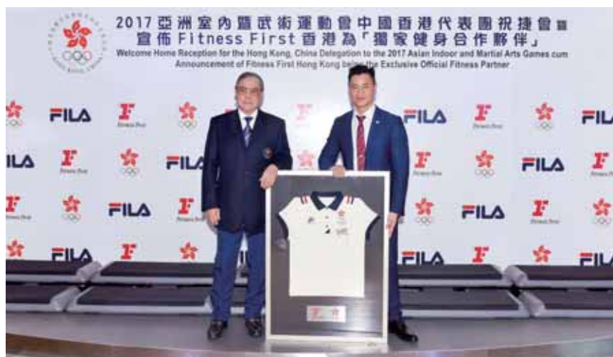
SF&OC and Fitness First announced a 3-year exclusive cooperation. 港協暨奧委會與 Fitness First 舉行為期三年的合作簽約儀式。

本會亦透過官方、個別辦事處、綜合項目運動會及大型活動的網站及 Facebook 專頁，以及「港協暨奧委會」應用程式發佈本會最新資訊，與市民聯繫。