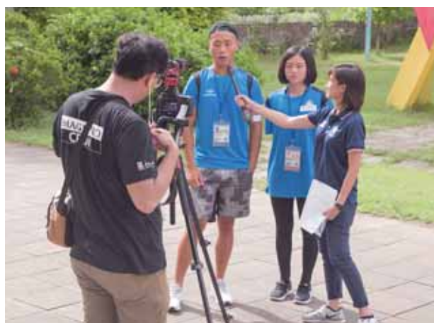
Media interview workshops mocking e-media interview. 傳媒關係工作坊模擬電子媒體訪問。