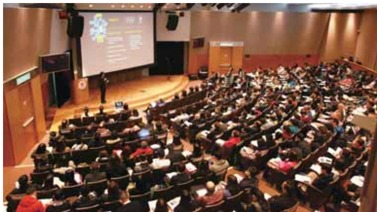
Seminar on Eliminating Discrimination and Anti-Sexual Harassment in Sports Sector 體育界消除歧視及防止性騷擾研討會

The Federation and the EOC also organized two subsequent workshops on preventing sexual harassment and handling related complaints on 16 and 23 March 2018, with the aim of equipping participants with practical skills for handling sexual harassment complaints.