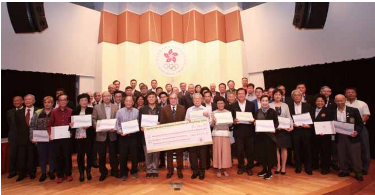
The Presentation Ceremony of SF&OC Incentive Awards & Junior Incentive Awards 2017 港協暨奧委會2017獎勵計劃及青少年獎勵計劃頒獎儀式

2017年度之獎勵計劃及青少年獎勵計劃總獎金金額為港幣2,637,110元，其中獎勵計劃獎金總數為港幣1,709,360元，青少年獎勵計劃獎金總數為港幣927,750元。獲得獎金之46個體育總會名單可參閱附錄四。