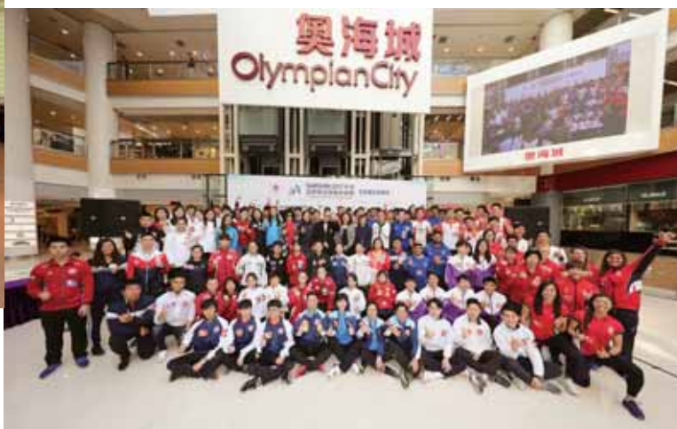
More than 100 athletes attended the Public Voting Announcement Press Conference. 超過 100 位候選運動員出席公眾投票記者會。