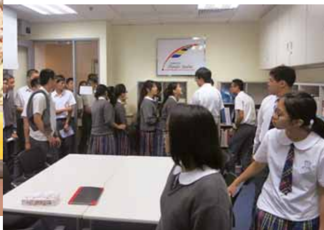
OEP school visit to Centre for Olympic Study at Olympic House for a briefing on Olympic Movement history in Hong Kong. OEP 計劃的學校參觀奧運大樓的奧林匹克資料中心，了解香港奧林匹克運動的歷史。