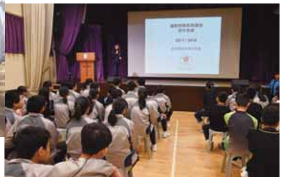
Education talk organized by HKADC for SKH Holy Carpenter Secondary School. 香港運動禁藥委員會為聖公會聖匠中學舉辦教育講座。

在年報期間一共為360位中學師生舉辦了4次講座向青少年推廣公平競賽的信息及宣揚體育精神。社區方面，除定期於香港體育學院設置外展教育攤位，更為本地體育活動舉行了共6次運動禁藥管制外展教育計劃，其中包括渣打香港馬拉松嘉年華及香港體育學院開放日。