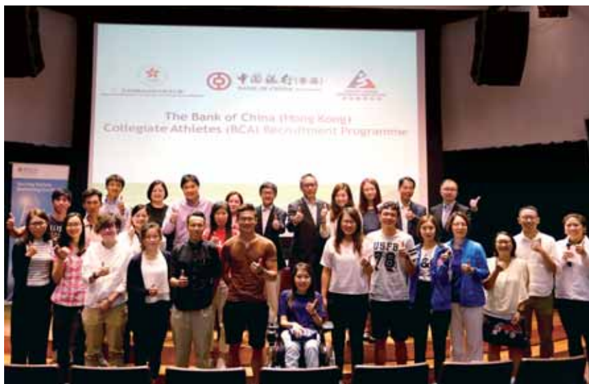
HKACEP organized a briefing on Bank of China (Hong Kong) Collegiate Athletes Recruitment Programme. HKACEP 舉行「中銀香港招聘大學生運動員計劃」簡介會。