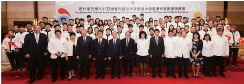
The Flag Presentation Ceremony for the Hong Kong, China Delegation to the 5 th AIMAG 第5屆亞室武運中國香港代表團授旗典禮

The 5 th Asian Indoor and Martial Arts Games (AIMAG) was held in Ashgabat, Turkmenistan from 17 to 27 September 2017. The Federation sent a strong delegation with 114 athletes and 57 officials to participate in 10 sports, namely Indoor Athletics, Billiard Sports, Bowling, Track Cycling, DanceSport, Futsal, Muaythai, Short Course Swimming, Taekwondo and Indoor Tennis. Our Hong Kong athletes brought home a haul of 35 medals, including 10 Gold, 11 Silver, 14 Bronze from 7 sports, and ranked 10 th in the medal tally of 5 th AIMAG.