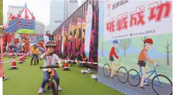
Kid enjoying the push bike trial set up by SLS. 小朋友在試玩「奧夢」設置的平衡車。