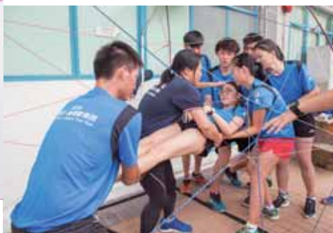
Team activities reflecting trust and friendship. 團體活動體驗互信及友愛。