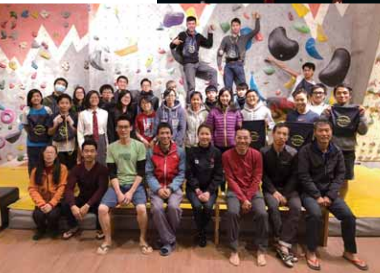
HKADC shared anti-doping knowledge with the Hong Kong Sports Climbing Squad. 香港運動禁藥委員會向香港運動攀登集訓隊成員講解運動禁藥管制知識。