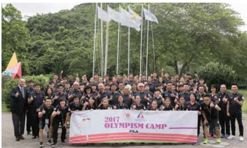
Closing Ceremony of the 2017 Olympism Camp 第五屆「奧林匹克主義體驗營」 閉幕禮

The Olympism Camp is one of the Federation's highlighted events in promoting Olympism and Olympic values. It aimed at delivering participants with the core values of Olympism and further assimilating them into their daily lives. The Federation has organized different camps for elite athletes and secondary school students separately during summer and winter holidays since 2013.