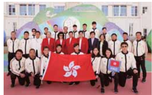
The Team Welcome Ceremony of Hong Kong, China Delegation was held at the Village Plaza of the Athletes Village. 中國香港代表團歡迎儀式於選手村舉行。

是屆代表團出戰亞室武運除得到民政事務及康樂及文化事務署的全力支持外，本會特此鳴謝的贊助商Fila Marketing (Hong Kong) Limited。