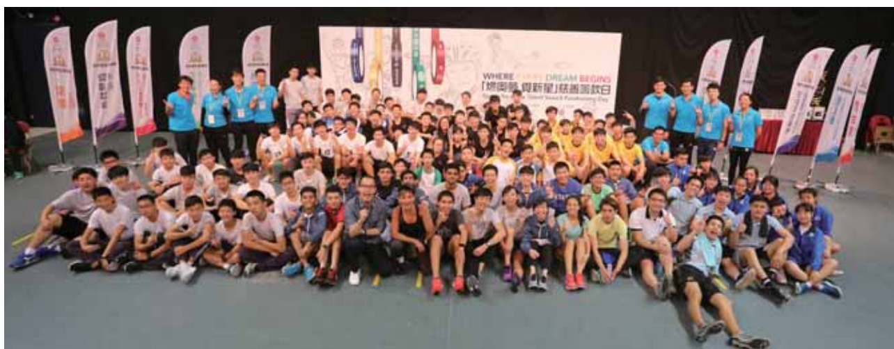
SLS co-organized the "Sports for Hope Talent Search Fundraising Day". 「奧夢」合辦「燃奧夢·覓新星」活動。