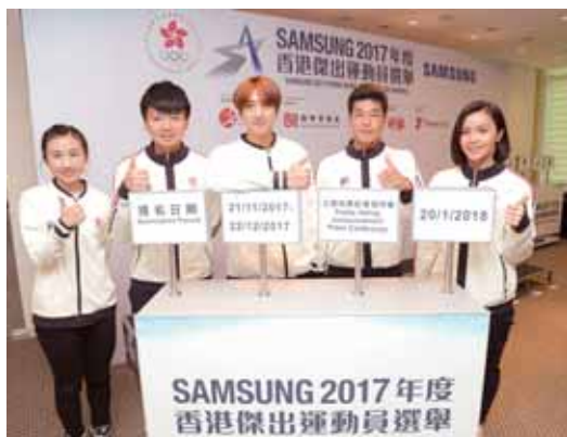
Past awardees of Hong Kong Sports Stars Awards at Event Announcement Press Conference. 香港傑出運動員選舉歷屆得獎者出席活動記者招待會。

A Press Conference was held at the Olympic House on 21 November 2017 to announce the details of the Rules and Regulations to the press and NSAs representatives. The Public Voting Announcement Press Conference was held at Olympian City on 20 January 2018 to disseminate the public voting mechanism to the public. More than 100 athletes were present to support the Press Conference to appeal to Hong Kong public to cast their votes for their sports stars. Members of the public were invited to vote for their favourite athletes and teams on-site. A Media Luncheon for Sports Media was held at the Regal Hong Kong Hotel on 1 February 2018.