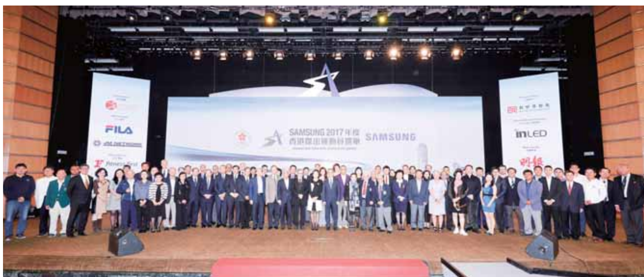
Samsung 2017 Hong Kong Sports Stars Awards Award Presentation Ceremony 「Samsung 2017 年度香港傑出運動員選舉」頒獎典禮

三星電子香港有限公司連續第五年冠名贊助「香港體壇奧斯卡」。活動得到康樂及文化事務署的資助。其他贊助機構包括首席夥伴新世界發展有限公司、官方LED屏幕夥伴崎生視訊有限公司、官方夥伴Fila Marketing (Hong Kong) Limited及協德網絡、媒體夥伴明報報業有限公司及官方贊助Fitness First (香港)對選舉的鼎力支持。本屆選舉共收到49個體育總會共133項提名。其中包括98項個人項目，9項運動隊伍及26項運動組合提名，競逐六個獎項，包括：香港傑出運動員、香港傑出青少年運動員、香港最佳運動隊伍、香港最佳運動組合、香港最具潛質運動員及香港最具體育精神運動員，當中獲得票數最高之香港傑出運動員更會獲頒Samsung星中之星香港傑出運動員大獎。籌備委員會負責提名的審核，而評審團負責評選。本地體育版記者/編輯及公眾可投票給其中四個選舉項目。