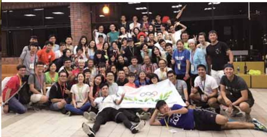
Group photo at Olympic Night. 「奧運之夜」合照。