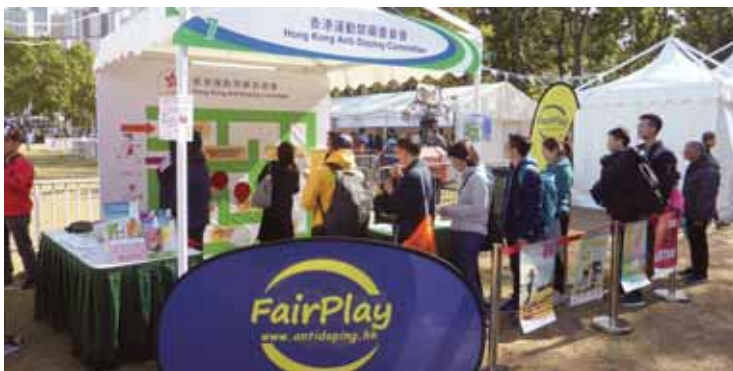
Event outreach programme at the Standard Chartered Hong Kong Marathon Carnival. Participants learnt about anti-doping through fun-filled games. 香港運動禁藥委員會於「渣打香港馬拉松嘉年華」舉行外展教育活動，參加者透過有趣的遊戲認識運動禁藥管制。

During the reporting period, a total of 4 education talks were organized for 360 students and teachers in order to promote the message of fair play and the spirit of sport to youths. Apart from the routine outreach session in Hong Kong Sports Institute, the message was promoted to the public through 6 events held at various local sport events, including the Standard Chartered Hong Kong Marathon Carnival and the Hong Kong Sports Institute Open Day.