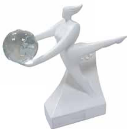
IOC Trophy 2017 – “Sport beyond borders” 2017年度國際奧委會大獎 — 「運動跨越界限」

The IOC Trophy 2017 “Sport beyond borders” was awarded to the MTR Corporation Limited to honour its continuous support to facilitate athletes’ career transformation after athletes’ retirement.