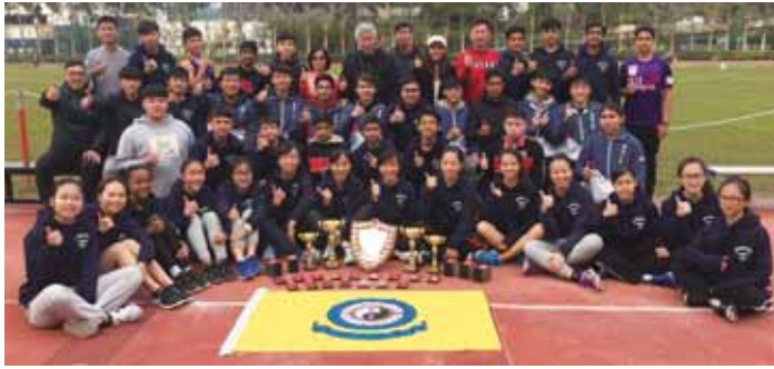
Group photo of Hong Kong Taoist Association The Yuen Yuen Institute No.3 Secondary School Athletic Team. 香港道教聯合會圓玄學院第三中學田徑隊成員大合照。

Apart from school training, the Scheme also extended the Olympic Spirit to the community by participating in major sporting events in Hong Kong. SLS was invited to become an Official Community Partner of TGEC and to provide sports activities during 21 January, 7 and 9 February in The AIA Great European Carnival. The scheme offered a push bike trial and 3 easy tests to the public – a standing long jump test, handgrip test and singled leg with eyes closed test. Total attendance was 800 over 3 days.